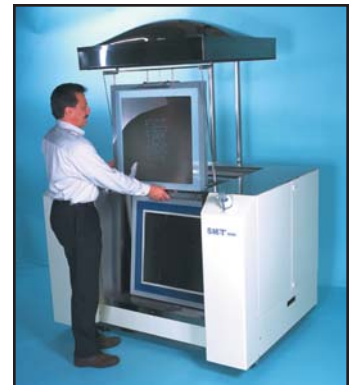
Fig. 3 Visit the Smart Sonic Website for additional information and photos on the Model 6000 and other stencil cleaning products:

Specifications are subject to change without notice. For additional information or photos, visit the Smart Sonic Website.